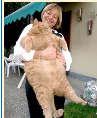
"I love Lasagne!"

There's no doubt this flabby feline has taken Garfield's advice to heart - "Eat every meal as though it were your last".