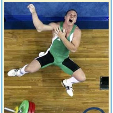
Look at my trick elbow!

Medical experts say this type of strain will probably need a bit more than Dencorub.