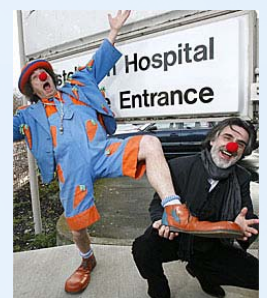
Choice bro - stop clowning around!

Clown Doctors already operate in other programs around the world, including in Australia, but it is the first time they will go to work in NZ.