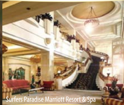
Surfers Paradise Marriott Resort & Spa

Don't miss Judith Lucy Saturday 15 August Breakfast Session: Growing old disgracefully