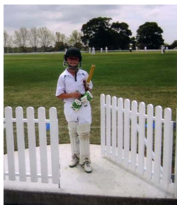
ABOVE: The littlest cricketer heads out onto the paddock.