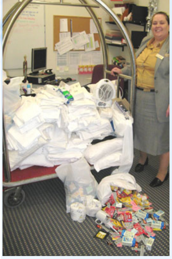
Novotel St Kilda's recovered stash

It turns out the light-fingered pair had misappropriated goods including towels, linen, stationery, a heater, toilet paper and of course lots of little shampoos!