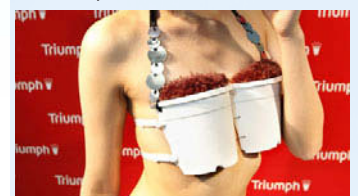
One cup of rice, or two?

"We wanted other women to experience farming as well - that's what inspired this bra," he said.