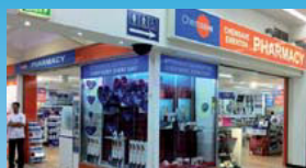
Full Branding Option with FREE Signage!

Plus, as a Chemsave compliant member, we will provide you with a suite of profit-boosting member benefits for FREE!