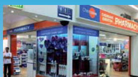
Full Branding Option with FREE Signage!

Plus, as a Chemsave compliant member, we will provide you with a suite of profit-boosting member benefits for FREE!