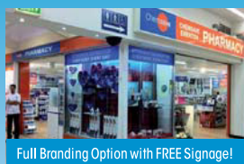
Full Branding Option with FREE Signage!

Plus, as a Chemsave compliant member, we will provide you with a suite of profit-boosting member benefits for FREE!