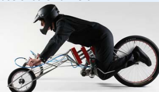
The next big thing on Aussie roads?

The students created the trike to compete in a design competition which required the use of screwdrivers.