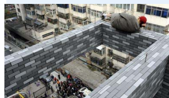
Taking a breezy nap with a view

The man however refused, and was only ousted from his possie when firefighters managed to scale up the roof and take him off.