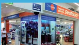
Full Branding Option with FREE Signage!

Plus, as a Chemsave compliant member, we will provide you with a suite of profit-boosting member benefits for FREE!