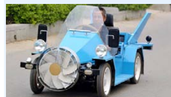
Would you call it stylish?

"It has two sets of generators and batteries so one is charging while the other is working," he added.