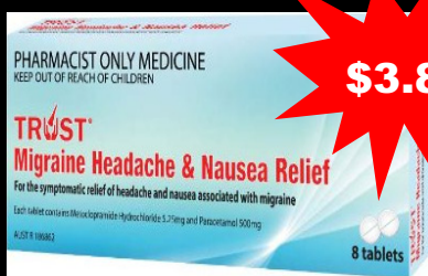
Trust Migraine & Nausea Relief 8 Tablets