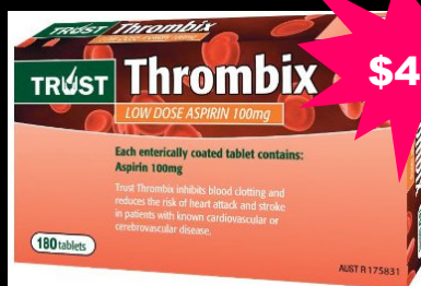
Trust Thrombix 180 Tablets