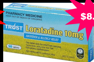
Trust Loratadine 10mg 50 Tablets