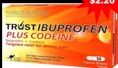
Trust Ibuprofen Plus Codeine 30 Tablets