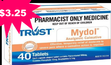
Trust Mydol 40 Tablets