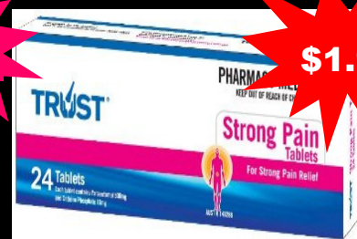
Trust Strong Pain 24 Tablets

Prices indicated are for individual units each