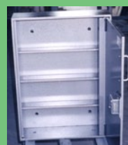
DS3 Key $1075.00

PRICES FROM $550.00 inc GST FREE FREIGHT AUSTRALIA WIDE