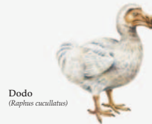
Dodo (Raphus cucullatus)