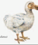
Dodo ( Rapinus cucullatus )