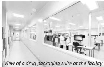
View of a drug packaging suite at the facility