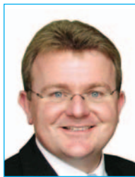
the Hon. Bruce Billson MP Federal Member for Dunkley Shadow Minister for Small Business Competition Policy & Consumer Affairs