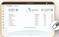
OTC Generic Conversion

Give your pharmacy an edge, be smart & identify opportunities, monitor KPIs & more with live dashboards