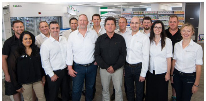
Members of the Willach team celebrating the launch of the new facility.

The new Willach head office and training facility is located in Building 11, 15 – 21 Huntingdale Road, in Burwood, Victoria and is open Monday to Friday 8.30am – 5pm.