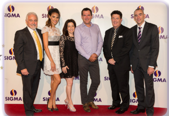
Community Amcal Pharmacy (WA) Community Engagement Pharmacy of the Year 2014