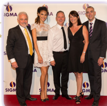
Urunga Amcal Pharmacy (NSW) Pharmacy of the Year 2014 (Amcal)