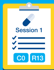
Patient Adherence Compliance