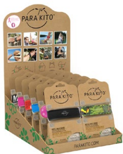
BEST SELLERS Product Code: PARWCP EAN: 9419844111130