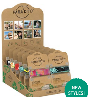
GRAFFIX BANDS Product Code: PARWGF EAN: 4897042370217