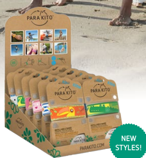
KIDS BANDS Product Code: PAKDSP EAN: 9419844111031