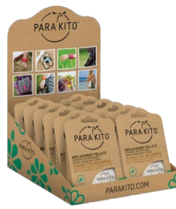
REFILLS Product Code: PARDSP EAN: 4897042370194