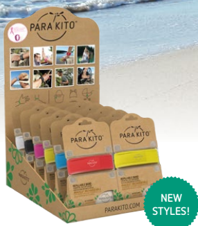
COLOUR BANDS Product Code: PARWCL EAN: 4897042370200