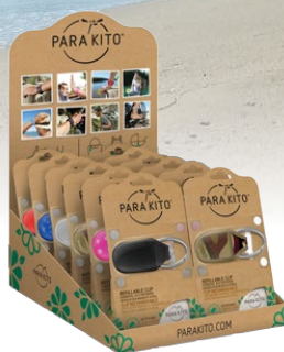
CLIPS Product Code: PACDSP EAN: 4897042370224