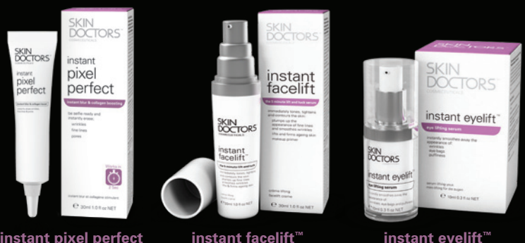
instant pixel perfect