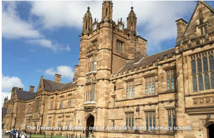
The University of Sydney: one of Australia's oldest pharmacy schools