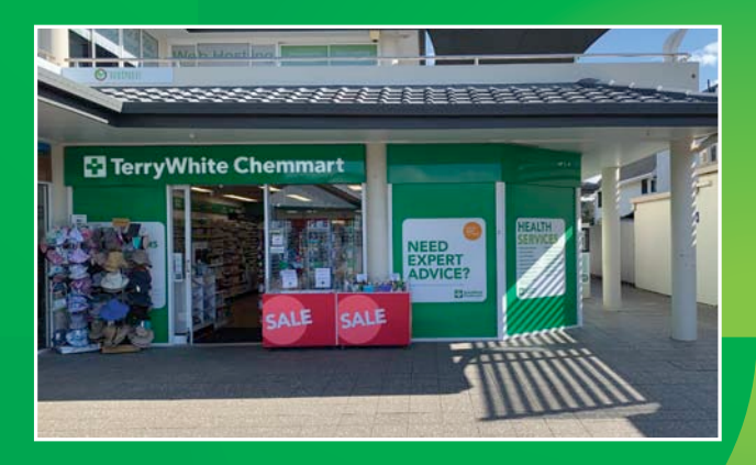
Welcome to the teams from 🚰 MONT ALBERT 📴 LENNOX HEAD

"The decision to change brands was made a lot easier with the support provided by TerryWhite Chemmart. From the initial planning stages to the implementation of the fit out, the effort provided was above and beyond what was expected. All queries were answered in a timely manner and unforeseen events dealt with in a timely manner. It was a pleasure going through the process with the support team"