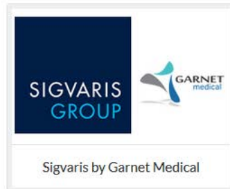
Sigvaris by Garnet Medical