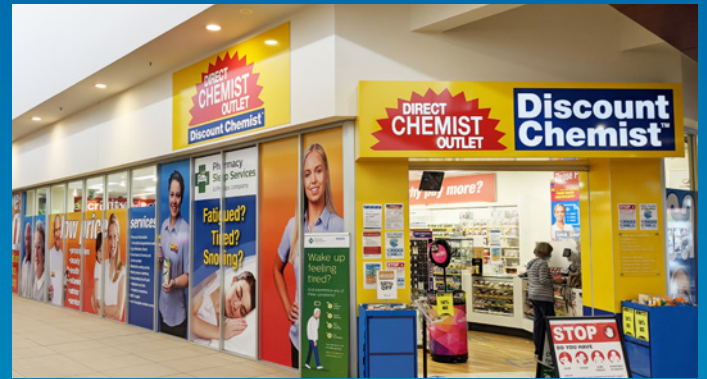
DCO WALLAN - OPENED SEPTEMBER 2020