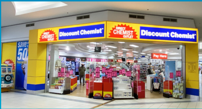
DCO LANGWARRIN - OPENED OCTOBER 2020