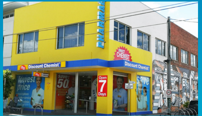
DCO BRUNSWICK EAST - OPENED OCTOBER 2020

ARE YOU TRYING TO COMPETE WITH THE BIG GUYS & NOT HAVING ANY SUCCESS?