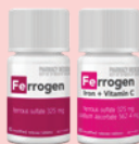
Ferrous Sulfate Range