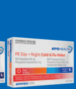
COLD & FLU

Contact your Sales Representative today or call 1800 276 839.