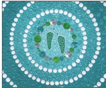
australian pharmacy council Approaches to implementation of cultural safety in the training and education of health professionals in Canada, Australia, New Zealand and the United States of America Literature Review

Substantial differences in the health of Indigenous peoples are described in the research