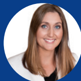
Emma McBride PM Shadow Assistant Minister for Mental Health & Carers, and Federal Member for Dobell