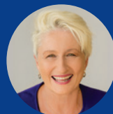
Dr Kerryn Phelps AM One of Australia's best-known doctors and public health advocates