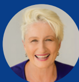
Dr Kerryn Phelps AM One of Australia's best-known doctors and public health advocates