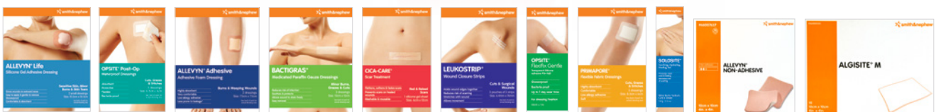
ALLEVYN ® LIFE Sacrum Foam Dressing

Smith & Nephew Pty Ltd Australia T +61 2 9857 3999 F +61 2 9857 3900