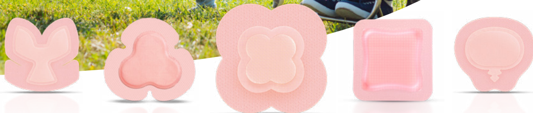
ALLEVYN ® LIFE Heel Foam Dressing