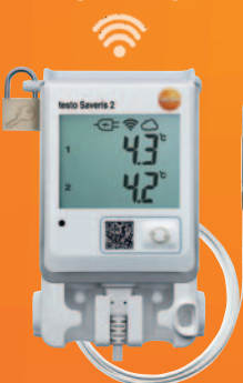
Single fridge kit