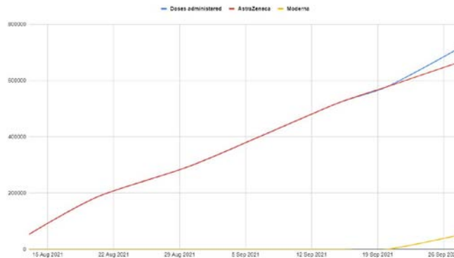
COVID-19 vaccines administered through community pharmacies to 28 September 2021.

recorded the highest number of doses administered, 19,500 - or an average of 44 shots per pharmacy - with NSW-based stores giving 16,900 doses (averaging close to 30 doses each).