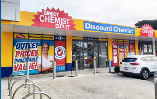
Direct Chemist Outlet Dingley Opened March 2021