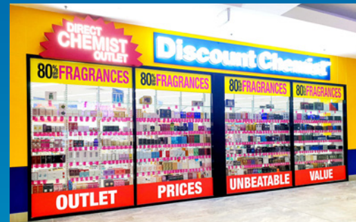
Direct Chemist Outlet Karingal Opened November 2021

ARE YOU TRYING TO COMPETE WITH THE BIG GUYS & NOT HAVING ANY SUCCESS?