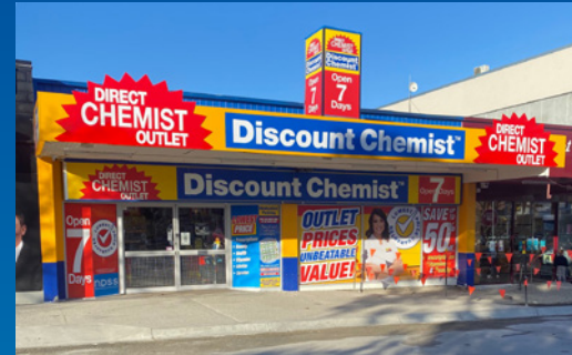
Direct Chemist Outlet Brentford Square Opened June 2021