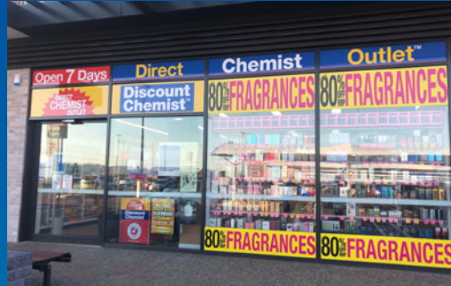
Direct Chemist Outlet Cobblebank Opened May 2021