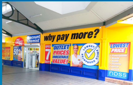
Direct Chemist Outlet Hampton Park Central Opened September 2021