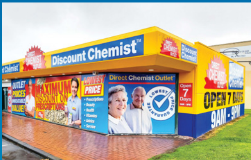
Direct Chemist Outlet Hampton Park Medical Opened August 2021