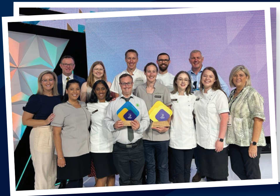
Coleman Court Pharmacy, Weston, ACT

to our Pharmacy Catalyst member, Coleman Court Pharmacy, winner of Guild Pharmacy of the Year!