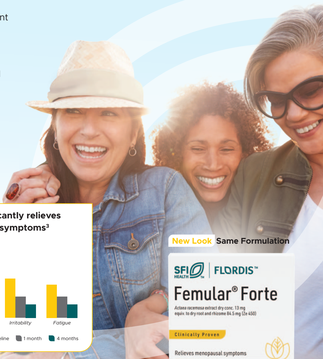
Femular significantly relieves menopausal symptoms 3

Recommend Femular first for multiple menopausal symptom relief.