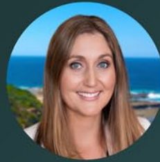
Hon Emma McBride MP

Assistant Minister for Rural and Regional Health