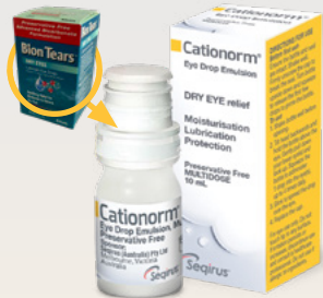
Available on the PBS

Cationorm's advanced positively-charged formula is suitable for all types of dry eye*1