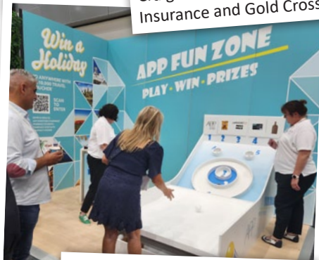
ATTENDEES taking on the challenges at the APP Fun Zone.