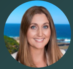
Hon Emma McBride MP

National Senior Associate, CommBank Health