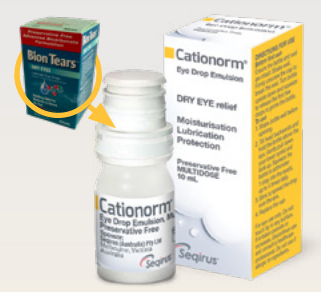
Available on the PBS

Cationorm's advanced positively-charged formula is suitable for all types of dry eye*1