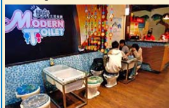
Just like eating in a toilet!

The owner claims that younger diners are attracted by the "edginess" of the eateries.