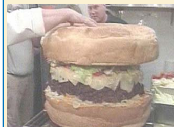
How about a bit of a bite?

Three men are needed to flip the burger, using two massive sheets of steel.