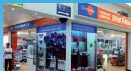
Full Branding Option with FREE Signage!

Plus, as a Chemsave compliant member, we will provide you with a suite of profit-boosting member benefits for FREE!