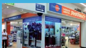
Full Branding Option with FREE Signage!

Plus, as a Chemsave compliant member, we will provide you with a suite of profit-boosting member benefits for FREE!