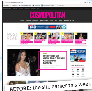
BEFORE: the site earlier this week.

The redirection glitch didn't impact anyone using the new address, or those who put 'www' at the start of the old URL to access the journal which moved to become a fully digital publication earlier this year ( PD 06 Jun), with