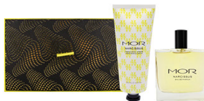
FLIGHTS OF FANCY NARCISSUS FRAGRANCE DUETTE GP366 | $59.95 RRP (VALUE $79.90)