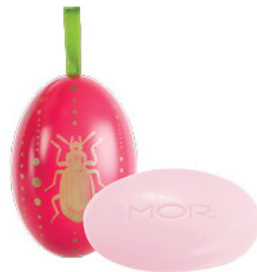
ENCHANTING EGG DECORATION MARSHMALLOW SOAP 50 g GP365 | $14.95 RRP