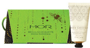
BEGUILING BAGUETTES SNOW GARDENIA HAND CREAM 30 mL GP344 | $12.95 RRP

All dressed up with somewhere to go it's off to party with the bejewelled and the fanciful, the beguiling and the spirited, as a spectacular display of wonder unfolds in The Enchanted Garden.