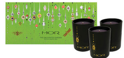
THE ENCHANTED GARDEN PETITE CANDLE TRIO GP363 | $39.95 RRP