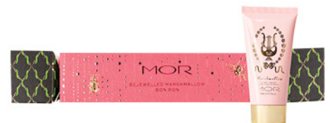
BEJEWELLED BON BON MARSHMALLOW GP348 | $14.95 RRP