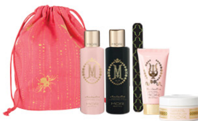
MAJESTIC AT MOONLIGHT MARSHMALLOW BATH & BODY SET GP357 | $48.95 RRP (VALUE $64.75)